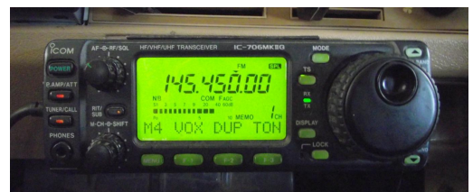
20dB over 9 noise across 2 metres

Recommendation: Do not use near 2 metres, fine elsewhere